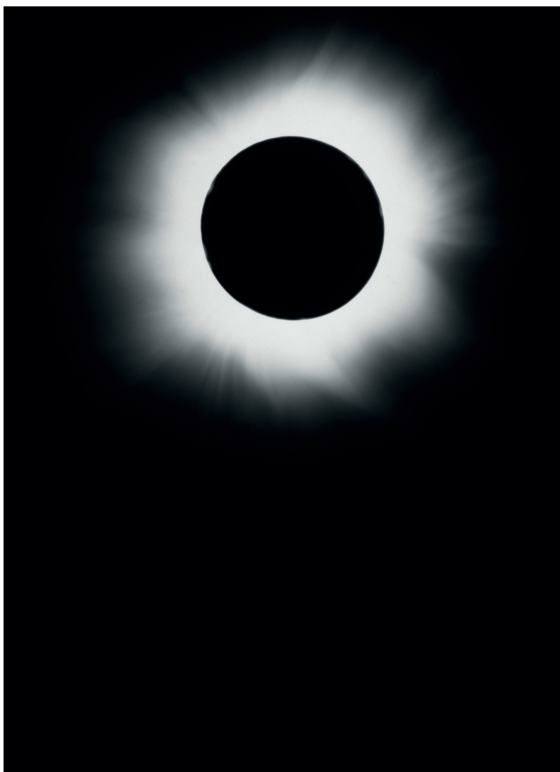
Kikuji Kawada From the series The Last Cosmology © Kikuji Kawada, Courtesy PGI

Exhibited as part of the “Arles Associé” sequence of the Rencontres d’Arles.